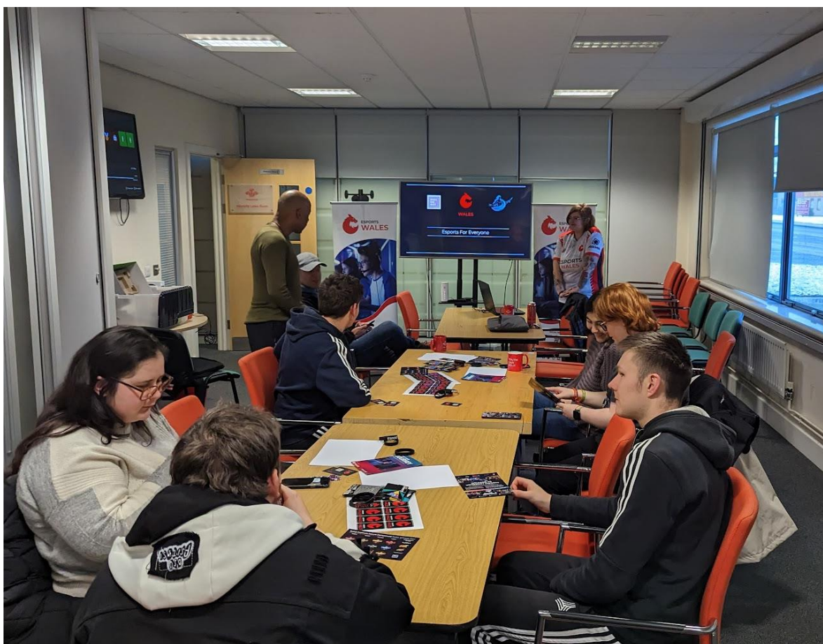
Delivery completed with Princes Trust in Cardiff.

opportunities to aspiring esports players. Our aim is to foster the growth of talent and provide a pathway for promising individuals to pursue successful careers in esports.