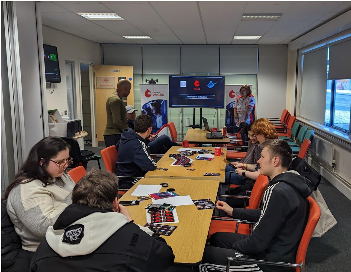
Delivery completed with Princes Trust in Cardiff.

Expansion of Esports Wales Academy Program: We will continue to enhance and expand our Esports Wales Academy Program, offering comprehensive training, coaching, and mentorship opportunities to aspiring esports players. Our aim is to foster the growth of talent and provide a pathway for promising individuals to pursue successful careers in esports.