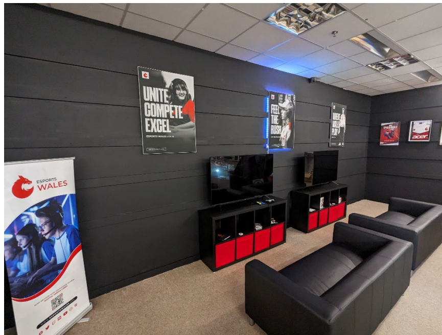
GB Games in Rhyl.

Esports Wales Local: Development of more Esports Wales Local's across Wales and how we can support and contribute to the local community.